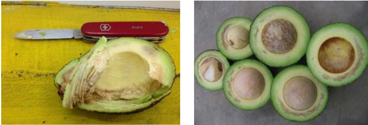
Figure 2. ‘Hass’ with in transit internal chilling injury (left) and orchard frost damage (right).